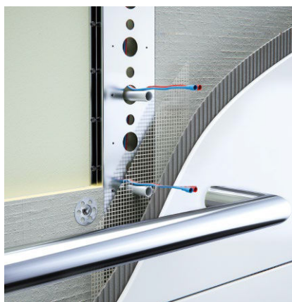
Image 1: Electric connection cables can be run behind the mounting rail for simple connection.