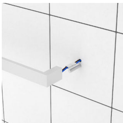
Image 2: All electrical connections can be made before tiling leaving the installer to simply connect the plugs and fix the rail to the spigot.