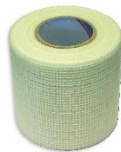
6015 Reinforcing Tape