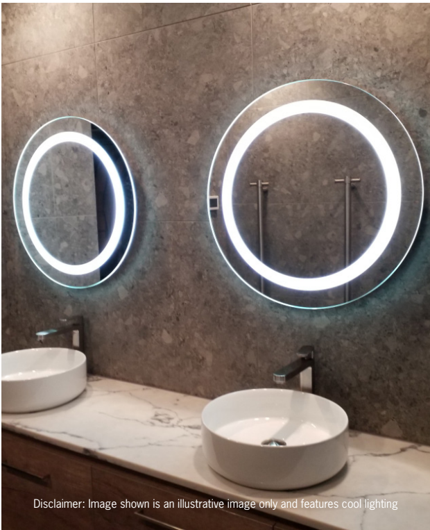
Disclaimer: Image shown is an illustrative image only and features cool lighting

Note: All dimensions are in millimetres (mm)