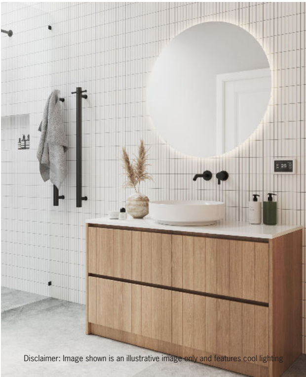
Disclaimer: Image shown is an illustrative image only and features cool lighting

Note: All dimensions are in millimetres (mm)