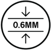
Heating pad thickness