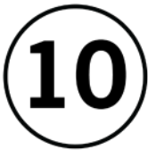
10 year warranty