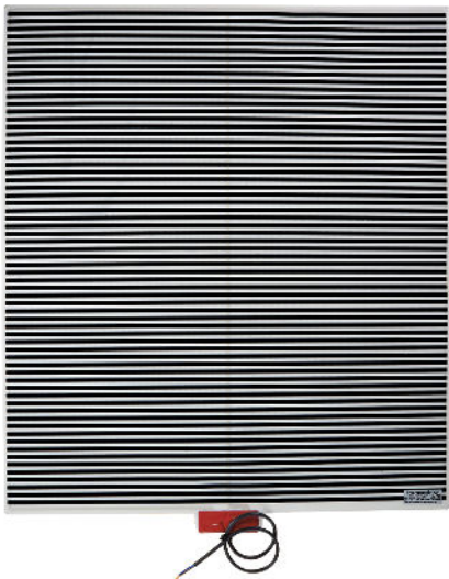
Note: All dimensions are in millimetres (mm)