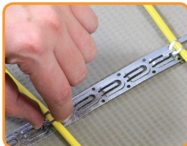
3259 Galvanised Fixing Profile

A 50mm roll of Fixing Tape is included in Thermoscreed Kits as a standard fixing method for use on any substrate.