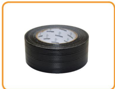
5418 Fixing Tape

Thermoscreed In Screed heating cables can be fixed in position with one of three fixing methods. The Fixing Tape is the standard fixing method used on any substrate. Optional methods include the Galvanised Fixing Profile for fixing onto concrete or timber substrates or In Screed Cable Mesh for use on a waterproofed substrate.